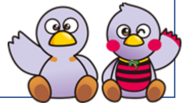
Saitama Prefectural Mascots "Kobaton" and "Saitamatch"