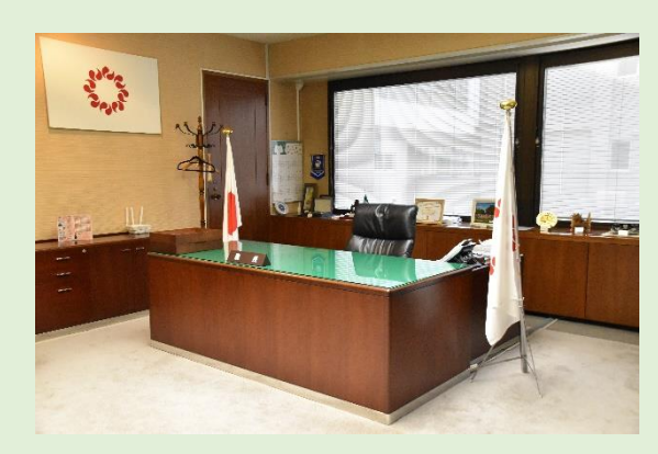
The Speaker's Office